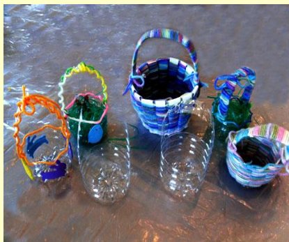
This is Lavonna's creation using plastic bottles