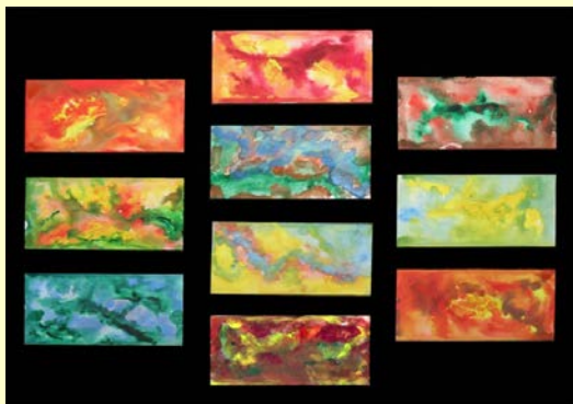
Title: Stamps of Beauty

Aura Liesveld will show us how to create a collage such as this using Business Cards and watercolors.