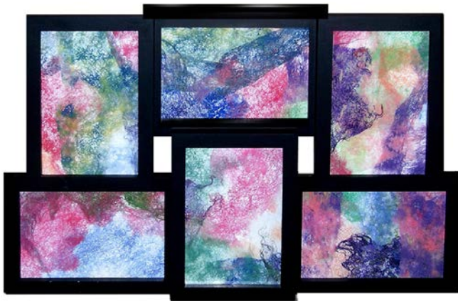
Title: Smooth Transitions

Aura Liesveld showed us how to create a translucent piece of art using Fabric softener sheets, painted with water colors.