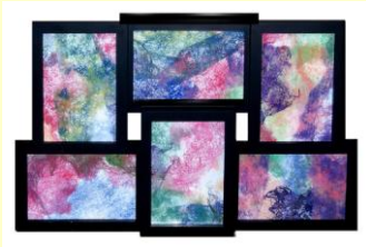
Title: Smooth Transitions with Fabric Softener sheets

Aura Liesveld will show us how to create a collage such as this using Fabric Softener sheets and watercolors. For paintings backing she used scraps from the frame packaging pictures.