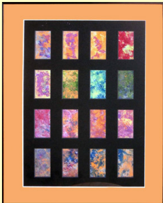
Title: Rapture of Colors Window

Aura Liesveld will show us how to create art with used Perms wrapping paper and Acrylics .